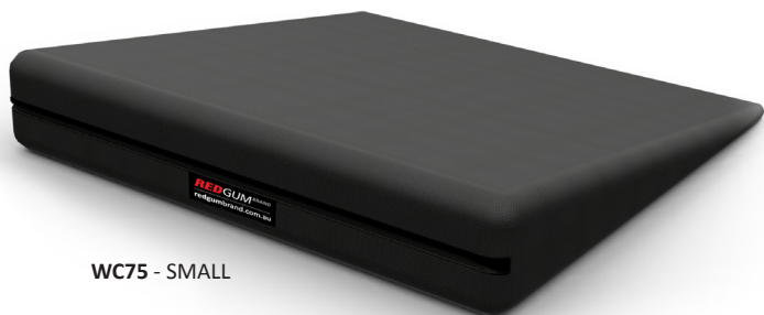
WC75 - SMALL