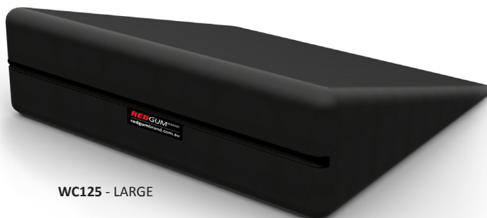
WC125 - LARGE