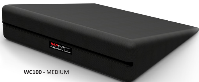
WC100 - MEDIUM